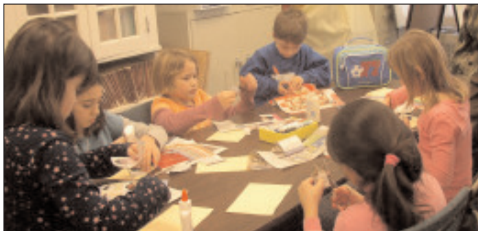
The Volunteer Club for Community Service busy at work!

for a Plainville adult daycare facility. Recently students made more than 400 flashcards to help English Language Learners in the Hartford area. "Through their thoughtful actions and their enthusiasm to use their recess to make a difference, these students are having fun and at the same time, demonstrating social responsibility and community involvement," noted Bucchi.